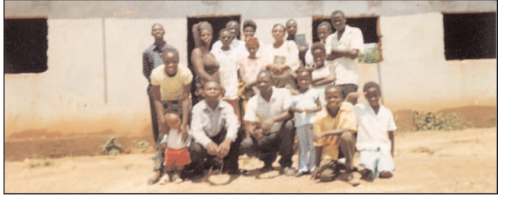
Massenger Church of Christ, Solwezi Zambia, Africa