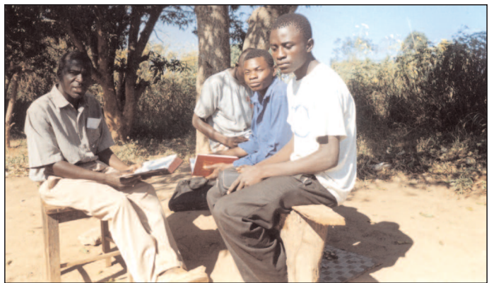
Bible Study - Kapepa Shenty Campgrounds. NOTE: Red Bible and used clothing from GIJAPA